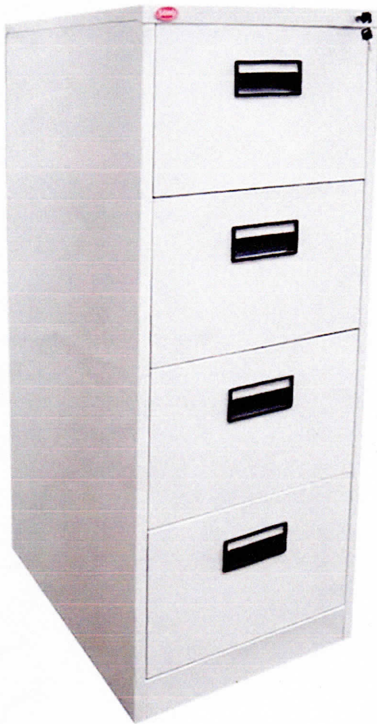
STEEL CABINET (4 DRAWERS)